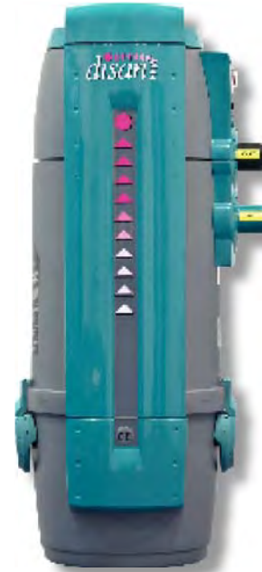
Muffler code GE270